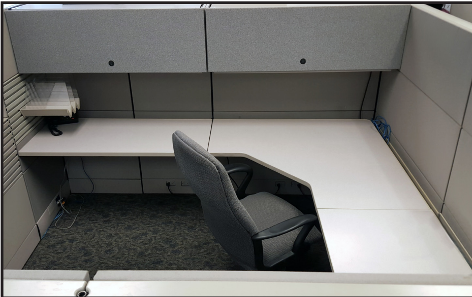
Example of office space/ cubicle

Associate Memberships DO NOT include a private cube or office.