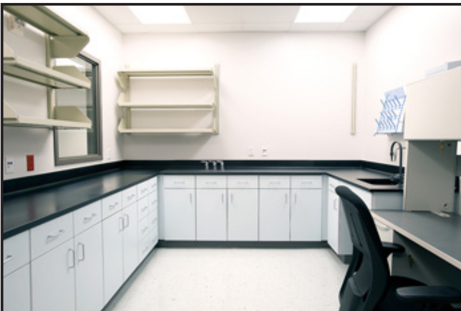
Example of lab space